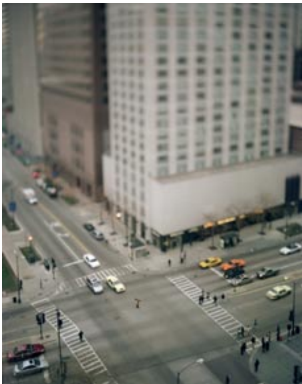
Patrick Messina, courtesy of Label Expositions